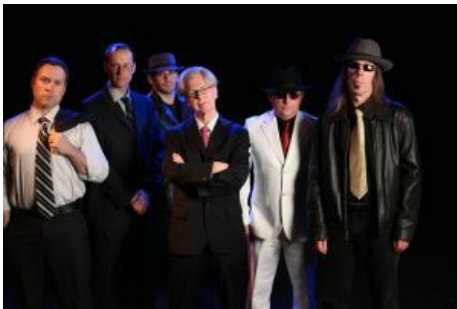
Members of Black 47 pose for a photo, with Larry Kirwan at center.