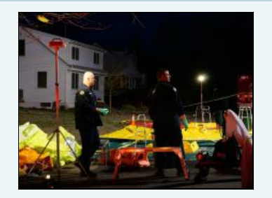
69-year-old ID'd as man who consumed fatal dose of cyanide at Fairfield home