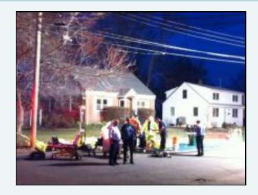
Hazmat emergency triggered after Fairfield man takes fatal dose of cvanide