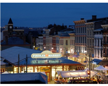
Taste of Fall

To get your tickets, head to: irishcenterofcincinnati.com.