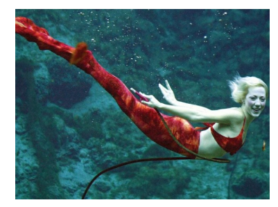
Weeki Wachee Mermaids

The world-famous Weeki Wachee mermaids of Florida's Weeki Wachee Springs are coming to Newport Aquarium this week.