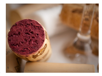
Wine, Art, Beer & Cigar Festival

Enjoy the distinctive taste and fragrance of a fine cigar, or check out the selection of more than 40 red and white wines and 25 craft beers.