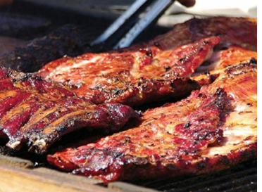
River Grill before the Big Chill