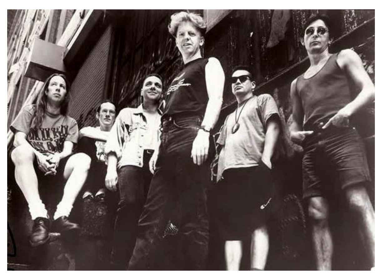
Band members in their early-90s heyday. BLACK 47

The band — with horns and pipes, sounding like a New Orleans marching band crashing an Irish pub — launched into "Elvis Murphy." Men in the audience spun women like tops. Young ladies step-danced like pistons. Beer spilled. The golf people looked on curiously.