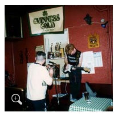
Black 47 in 1990 at Paddy Reilly's pub in Manhattan.