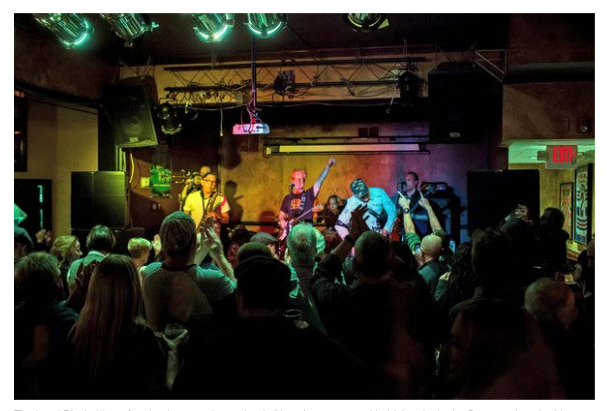
The band Black 47, performing last month at a bar in New Jersey, started in Irish pubs in the Bronx and worked its way up to stadiums and television appearances.

Black 47 to Perform Final Show in Midtown